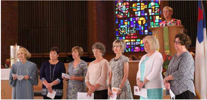
Installation of 2016-2017 DWM Executive Board & Group Chairs

All women are invited to join a circle group this year. The September meetings will take place on the 19th. Groups that will be meeting the 3rd Monday of each month include: